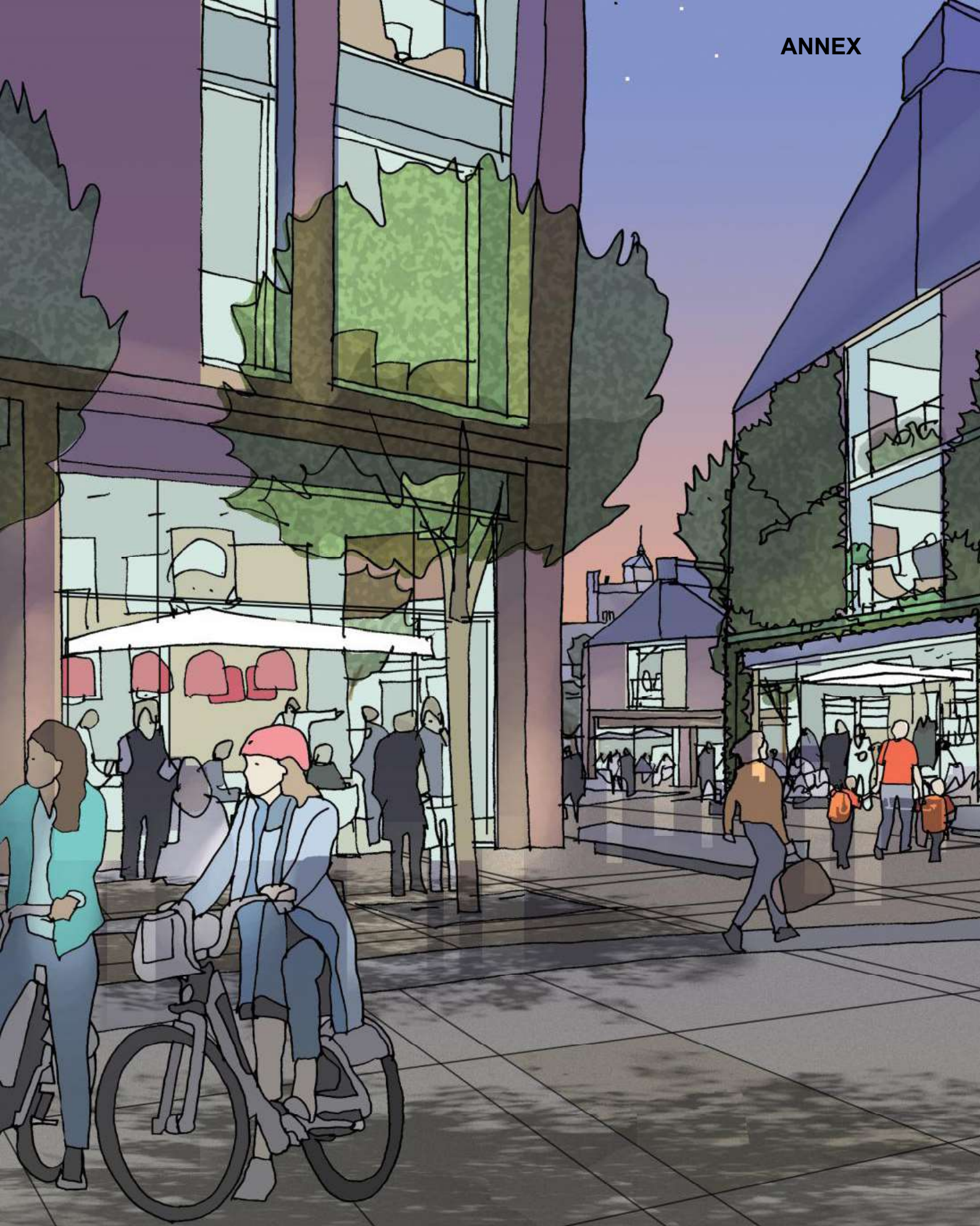
Romsey South of Town Centre Masterplan