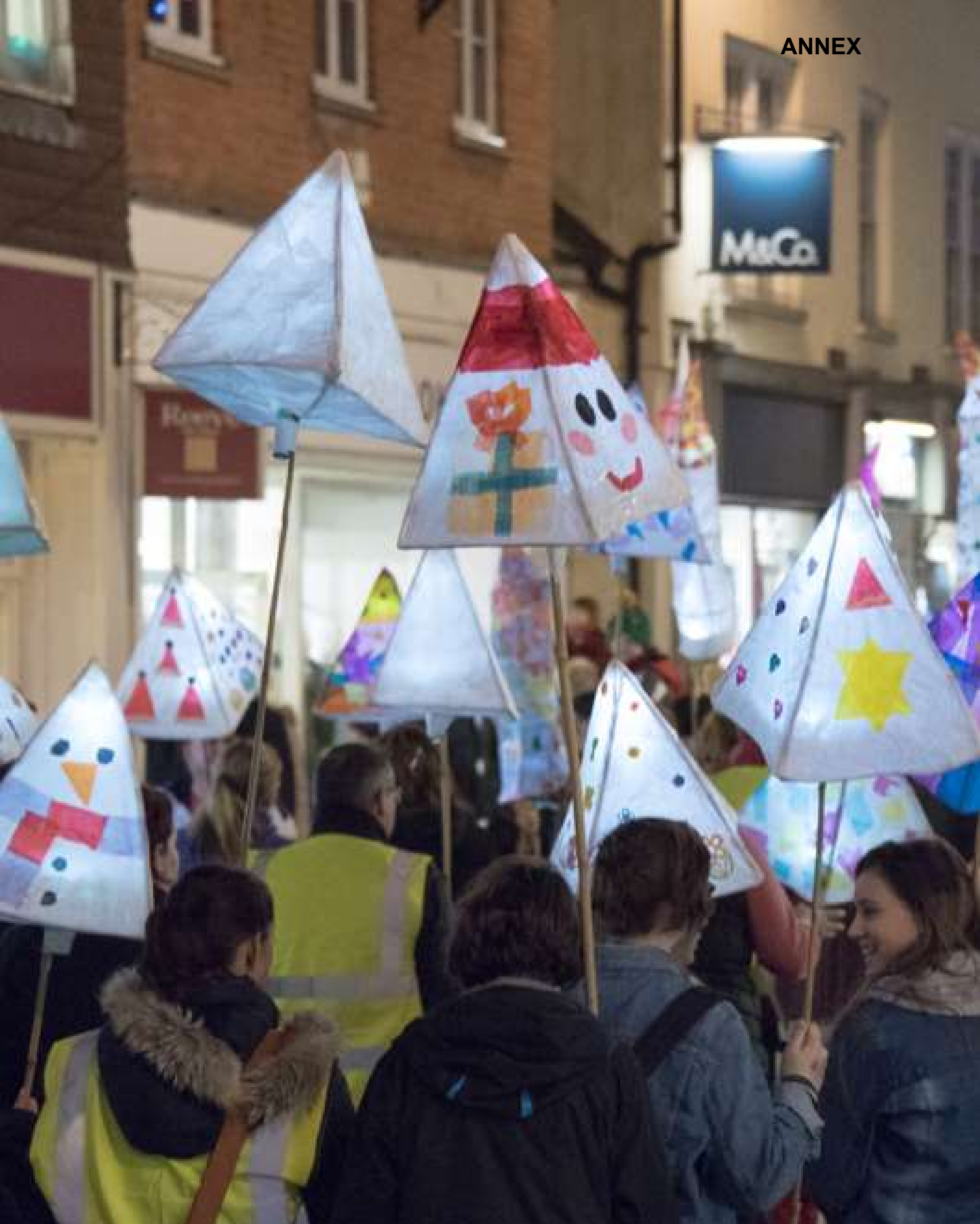
Romsey Lantern Parade